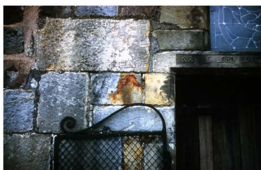
Fig. 1. Stone in situ externally at West Porch.