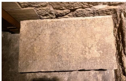
Fig. 2. Stone located at the North Transept.